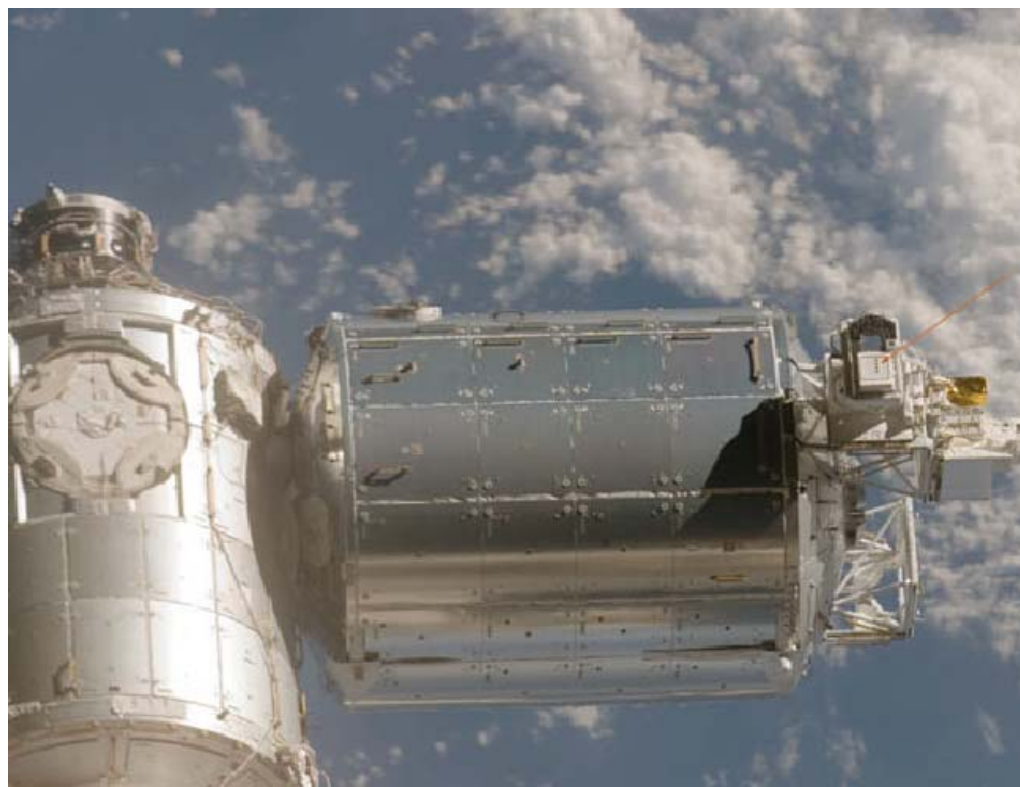
Fig.2: COLUMBUS in flight, SOLAR is indicated by the arrow (NASA document).

from the far-UV to the infrared. B.USOC is FSC for the PCDF (protein crystallisation diagnostics facility), a module inside the European Drawer Rack inside COLUMBUS. In both cases, the B.USOC experience antedates COLUMBUS as space solar instrument are operated by teams of all three institutes present in Uccle since 1983 (Belgian Institute for Space Aeronomy, Royal Meteorological Institute and Royal Observatory). Similarly, B.USOC operates protein crystallisation experiments since 2002. In the future, B.USOC will operate also for CNES the solar science monitoring satellite PICARD to be launched in 2010.