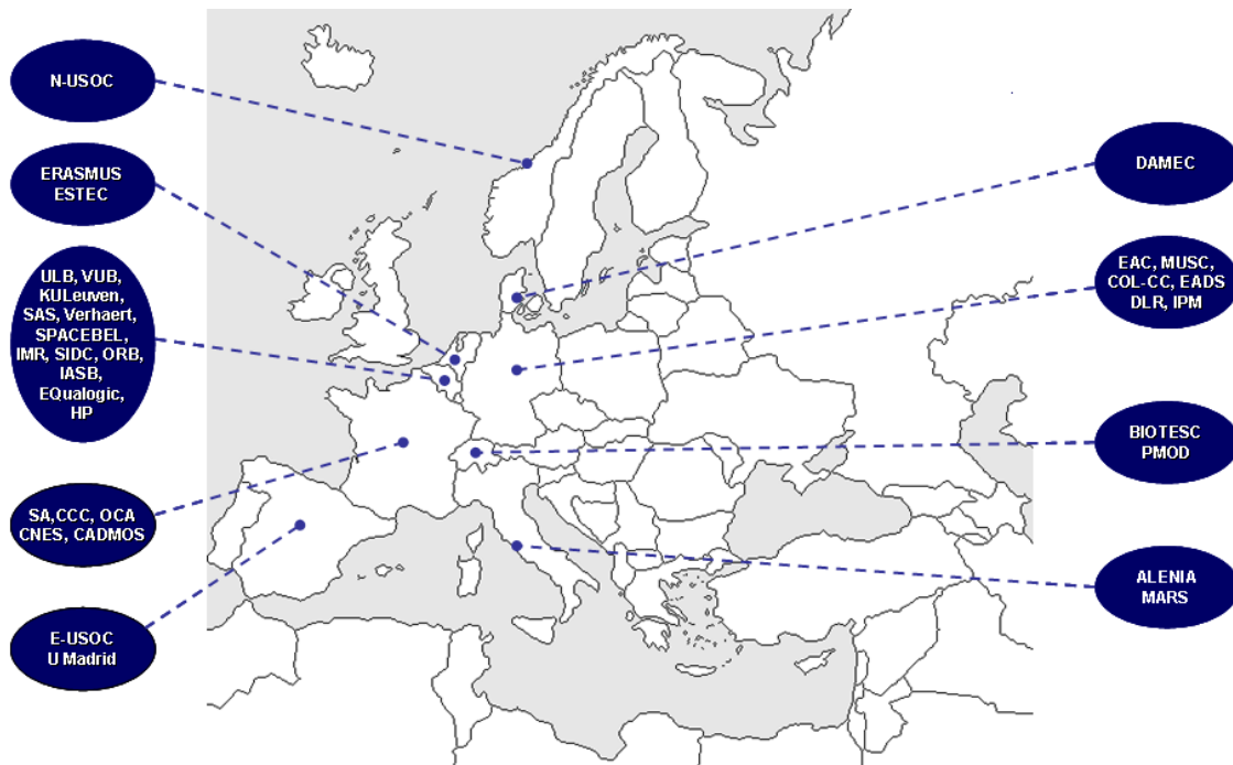
Fig.1: the current partners of B.USOC, N-USOC, ERASMUS, CADMOS, E-USOC, DAMEC, MUSC, BIOTESC and MARS are USOC's, COL-CC is the COLUMBUS control centre and the others are academic and industrial partners which have User Home Bases. Unsurprisingly, most of the partners of this second category are situated in Belgium. The ESA IGS connects only ESA facilities and the USOC's.

In any case, the USOC's play a role in the processing of electronic data and have the capability to store them and perform treatment according to the requirements of the PI's. It was thus natural to use this network when the synergistic use and preservation of all ISS data was envisaged.