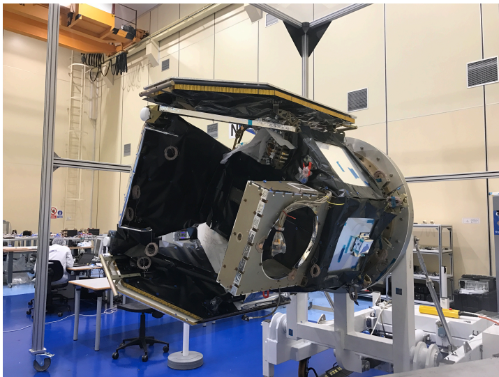
Integration of the CHEOPS Platform at ADS ECE, Spain