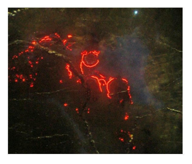
Figure 2: Cathodoluminescence image obtained of the D5 ROI in Fig. 1 (notice the bending crack for further identification) after applying electron bombardment at a voltage of 20-24 keV. As Fe is a typical quencher, the right red areas correspond to Fe-poor and Mn-rich carbonate layers that nicely mark the carbonate globule walls.

Instrumental procedure: As we were concentrated in the study of the carbonates found in our thin section (Fig. 2), we have used several SEM and microprobe to figure out the chemical composition of the globules. In particular, quantitative chemical analyses and BSE images of the carbonate globule walls were obtained using a JEOL JXA-8900 electron microprobe equipped with five wavelength-dispersive spectrometers at the UCM.