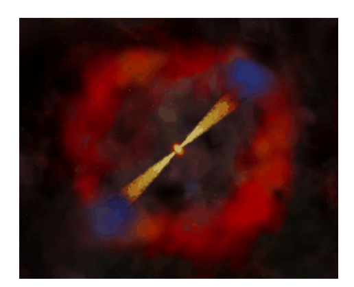
Figure 2 : Artist's impression of a GRB, see the INTEGRAL Picture of the Month for September 2004.

Preparations have begun for the next in-flight calibration (Crab) scheduled for End of September (rev 239, 27-30 Sep).