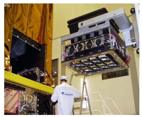
The IBIS detector unit is being integrated into the spacecraft's payload module at ESTEC, November 2001.

During the past weeks we have seen major progress on INTEGRAL: The scientific payload is complete and all flight models are integrated on the spacecraft; the scientific calibration on satellite level has started on January 23; system tests for the spacecraft and the ground segment are progressing smoothly; preparations for the launch on October 17 of this year are in full swing. This issue of the ISOC newsletter keeps you informed about the latest developments.