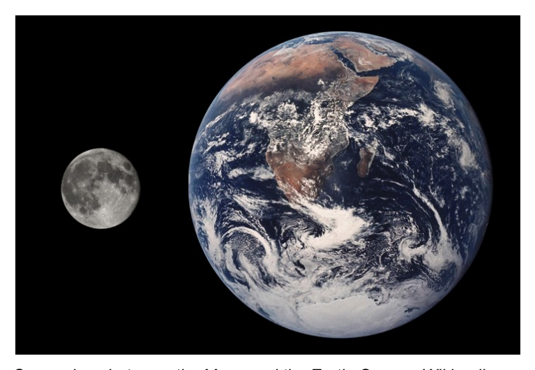
Comparison between the Moon and the Earth.

The Moon is the only natural satellite of the Earth. Look at the size of the Moon compared to the size of out planet, the Earth: